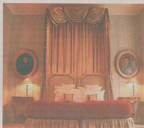
Above: Château de Bagnols, (25) Beaujolais, France; far left, Woolley Grange (12) Wiltshire; left, San Domenico House, (7) London