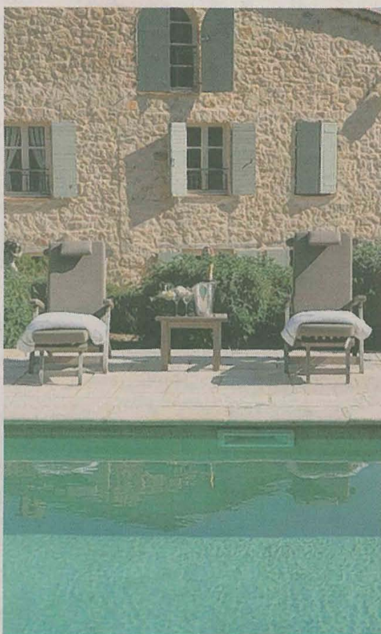
Above: Bastide de Saint Mathieu (26) Grasse, France; below, The Brew House (10), Tunbridge Wells, Kent

Tunbridge Wells has a decent Hotel du Vin, but for something a little different try